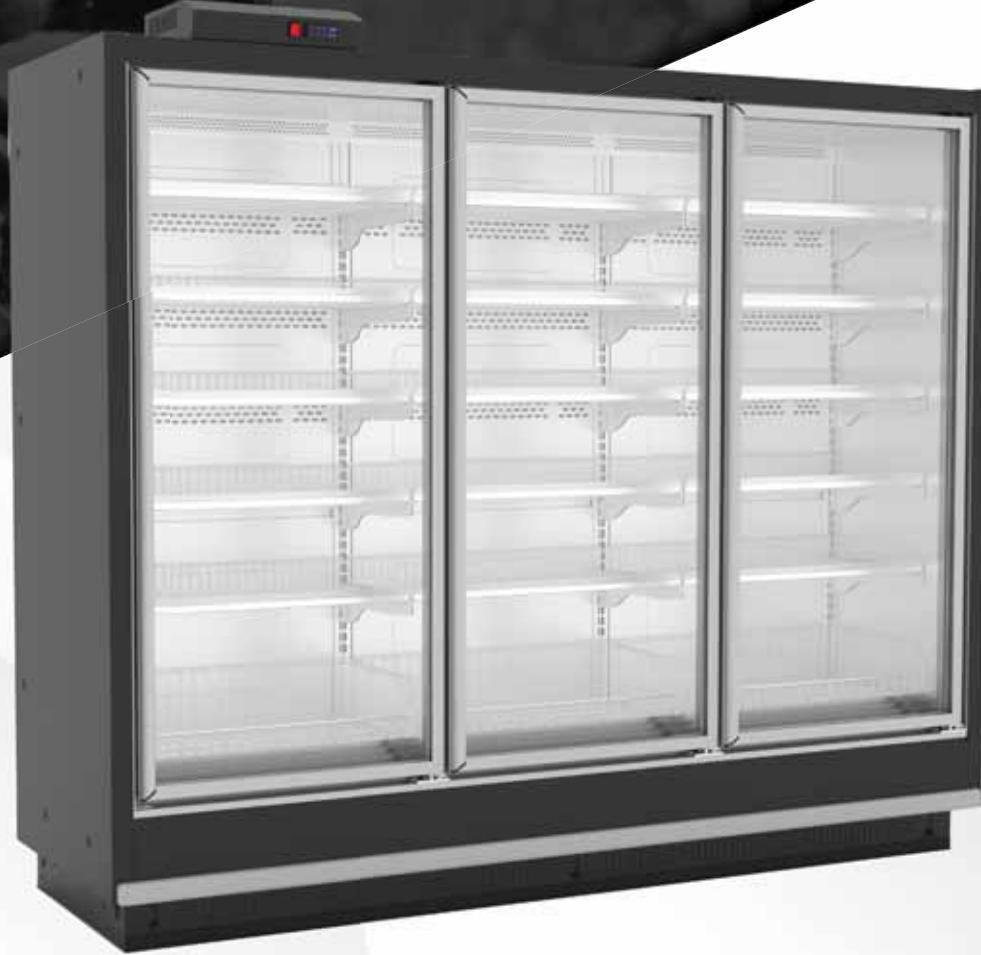
SCORPION V2 220-205